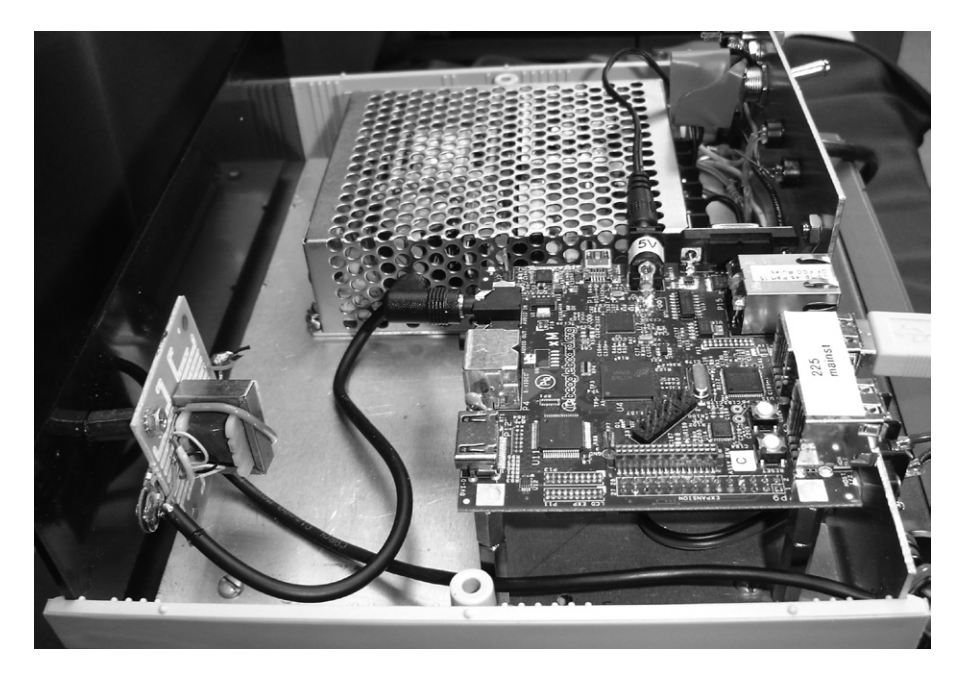
Figure 3 — This is an internal view of the remote control box. The BeagleBoard XM is in the lower right corner of the photo.

We might highlight the FSpin class in our Python code. This defines the control widget that manages the setting of the VFO frequency. It offers "up" and "down" buttons for each frequency digit that allow rapid tuning to a desired frequency. When the FSpin control has keyboard focus, it will also respond to the mouse wheel, which will tune a particular digit up or down. Direct frequency entry from the keyboard is also supported.