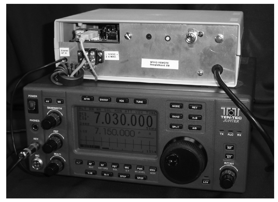
Figure 2 — Here is the remote control box containing the BeagleBoard XM computer and the Ten Tec Jupiter transceiver.

Creating an efficient Internet audio channel was the largest task in this project. There are numerous streaming audio systems available, but these can have long latencies that don't allow interactive Amateur Radio communications. We might have chosen to work with an open source VOIP scheme or a service like Skype , but in the end we chose to develop a simple transmission scheme that works well in this application.