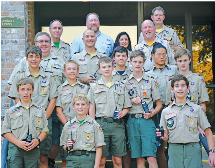
The Scoutmasters and Scouts of Troop 839, KW9BSA.

Another challenge was Scout parents not knowing which radios to buy. Thankfully, the four hams who were already in the troop committed to donating a radio when Scouts got licensed. Additionally, when a Scout earned their license, they would have completed most of the requirements for the Radio Merit Badge as well. Radios then became the